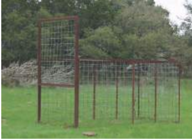
A typical box trap.