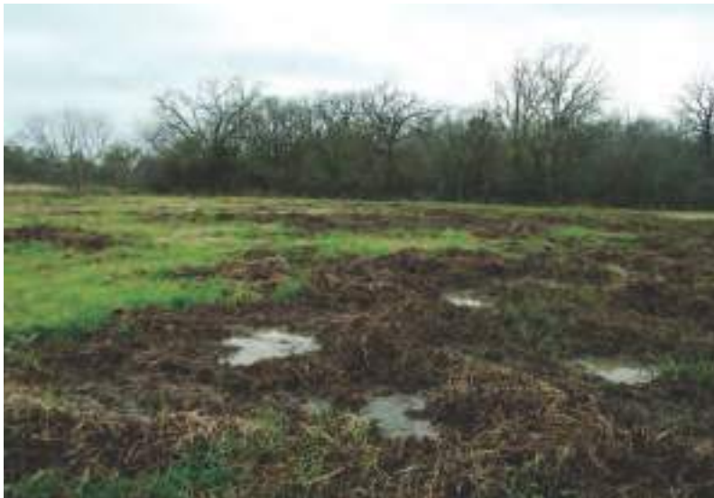
Damage to soil and vegetation caused by wild pig rooting.

Wild pigs have been listed as one of the top 100 worst exotic invasive species in the world (44). In 2007, researchers estimated that each wild pig carried an associated (damage plus control) cost of $300 per year, and at an estimated 5 million wild pigs in the population at the time, Americans spent over $1.5 billion annually in damages and control costs (45). Assuming that the cost-per-wild pig estimate has remained constant, the annual costs associated with wild pigs in the United States are likely closer to $2.1 billion today (10, 11, 45).