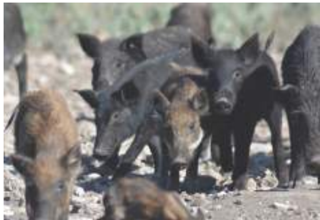
Litter of approximately 2-month-old wild pigs. (Heather Stearling, TPWD)

Pigs have the highest reproductive rate of any ungulate; but like reproductive maturity, it is highly variable among populations (23-25). Females (sows) have multiple estrous cycles annually and can breed throughout the year with an average litter size of 4-6 young per litter (5). The average gestation period for a sow is approximately 115 days and they can breed again within a week of weaning their young, which can occur approximately one month after birth (26, 27). Though it is a physiological possibility for a sow to have three litters in approximately 14 months (28), researchers found that in southern Texas adult and sub-adult sows averaged 1.57 and 0.85 litters per year, respectively (25). Birthing events can occur every month of the year, though most wild pig populations exhibit prominent peaks in birthing events that correlate with forage availability (25, 29) with peaks generally occurring in the winter and spring months (30). In areas where forage is not a limiting factor, such as lands in cultivation or where supplemental feeding for wildlife is common practice, reproduction rates can be higher than average (31).