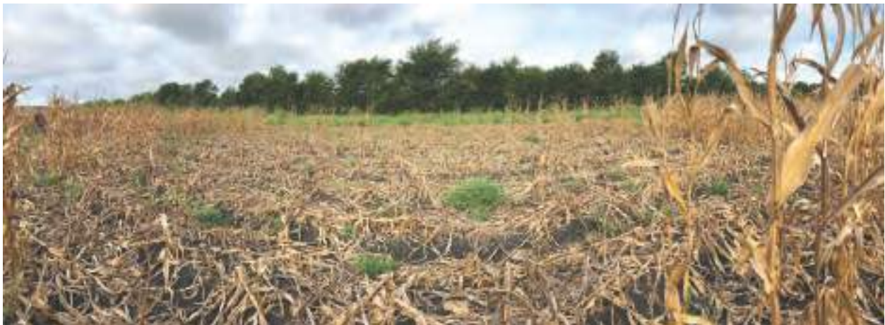
Damage to agricultural crops caused by wild pigs. (Bethany Friesenhahn, Research Specialist at Caesar Kleberg Wildlife Research Institute)

Economically, wild pigs have the greatest impact on the agricultural industry in the United States (2). In 2005, researchers estimated that in a single night, one wild pig can cause at least $1,000 in damages to agriculture (53). In Texas, a 2006 publication reported that wild pigs caused approximately $52 million in agricultural damage annually (54). More recent studies published in 2016 and 2019 estimate that the annual loss to agriculture in Texas is approximately $118.8 million (95, 96). Impacts to crops are not limited to direct consumption. Trampling of standing crops and damage to soil from rooting and wallowing activities account for 90-95% of crop damage, in some cases (55). Standing crops are not the only form of agriculture damaged by wild pigs. Wild pigs also cause damage to hay fields, orchards, farming equipment, and fences.