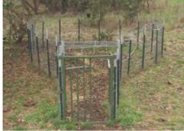
A typical corral trap made from cattle panels and T-posts.

one time. If used to target large sounders, those that are not successfully trapped may develop learned behavior which makes them more difficult to trap in the future (68).