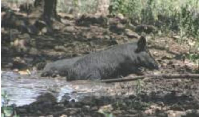
Wild pig wallowing in a pond.

it tends to increase the nutrient concentration and total suspended solids in nearby waters due to erosion (48, 50). Wild pigs also directly contribute fecal coliforms into water sources, increase sedimentation and turbidity, alter pH levels, and reduce oxygen levels (51, 52). Such activities lead to an overall reduction in water quality and degradation of aquatic habitats. Impacts from wild pigs are positively correlated with population density and vary in severity among ecosystems. Native habitat degrada-