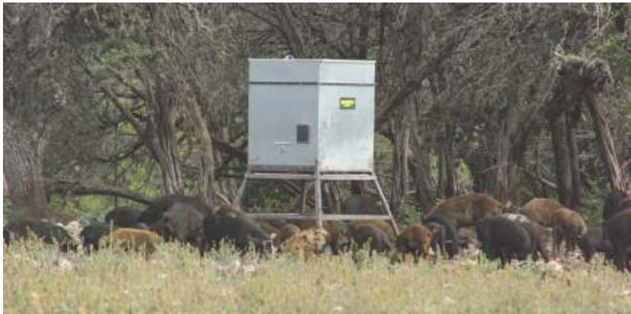
Wild pigs congregated at supplemental feed.

Some states which historically did not allow recreational hunting of wild pigs have established statewide hunting programs in an effort to solicit assistance from the public in controlling wild pig populations. Even though the intentions were good, these statewide hunting programs have sometimes resulted in population increases and rapid range expansions (15, 83, 84). Popularity of wild pigs as a game species coupled with economic incentives generated by trophy hunting industries has resulted in the human-mediated transportation of wild pigs (illegal in Texas) to areas previously not populated by wild pigs (84-86). For example, Tennessee implemented a statewide hunting program in 1999, and by 2011 wild pig populations expanded from 6 to 70 counties (84). Similarly, in 1956 when wild pigs were designated a game animal in California, their range was limited to just a few coastal counties. By 1999, however, they had spread to 56 of the state’s 58 counties (83, 85). One scientific