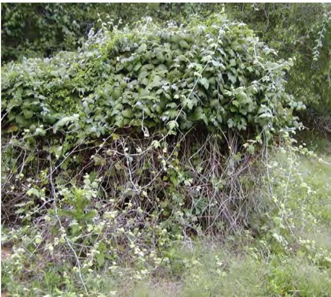
The negative impact of deer can be seen by browse lines and by the presence of plants that show hedging.

The impact of deer on a plant community has a cascading effect on deer and other animal populations. Invertebrates, reptiles, amphibians, birds, small and large mammals rely on diverse plant communities for food and cover, especially within those zones easily reached by foraging deer. Recovery of habitat affected by deer is impacted not just by short-term deer numbers, but also by the history and severity of over-browsing, soil conditions, and climate. Some studies indicate that drastic reductions in deer numbers have little effect on increasing plant diversity over the short-term and vegetation recovery may only occur through extended periods of low deer densities.