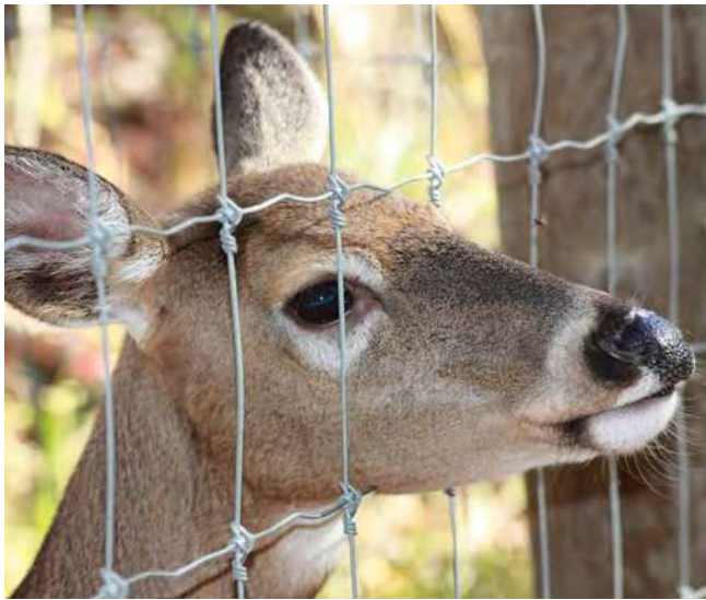
High fencing can be a long-term solution to human-deer conflicts

conducted at the community level. Hunting zones within the community are identified to maximize human safety and promote ethical, humane, and efficient deer harvest. Deer are often baited into the area for a period of time and then hunters are placed at those locations. Meat from carcasses must be used by the hunter or donated to a designated charitable organization. Both hunters and non-hunting residents must recognize that urban deer hunting is a management tool designed to reduce the number of deer, with considerable emphasis on removing females. This is not a trophy buck hunt. Hunting in Texas can be done using traditional hunting license tags or through hunting permit programs offered by TPWD that allow individuals to harvest more than regular bag limits ( Managed Lands Deer Permits or Landowner Assisted Management Permitting System ).