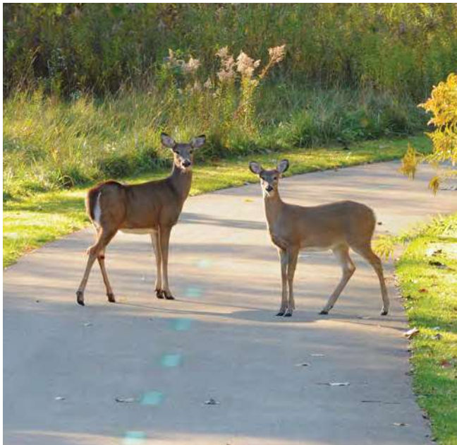
Many urban communities are experiencing overabundant deer populations, urban sprawl, and limited natural resources.

People attach dramatically different emotions and value systems to white-tailed deer. Some people view deer as an innocent, natural part of an unnatural setting that does not require intervention by people. Others view deer as ravenous ecological forces that must be removed from the landscape. Both opinions are to be respected, yet each is imperfect.